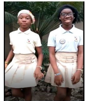
Youths Promoting Conference